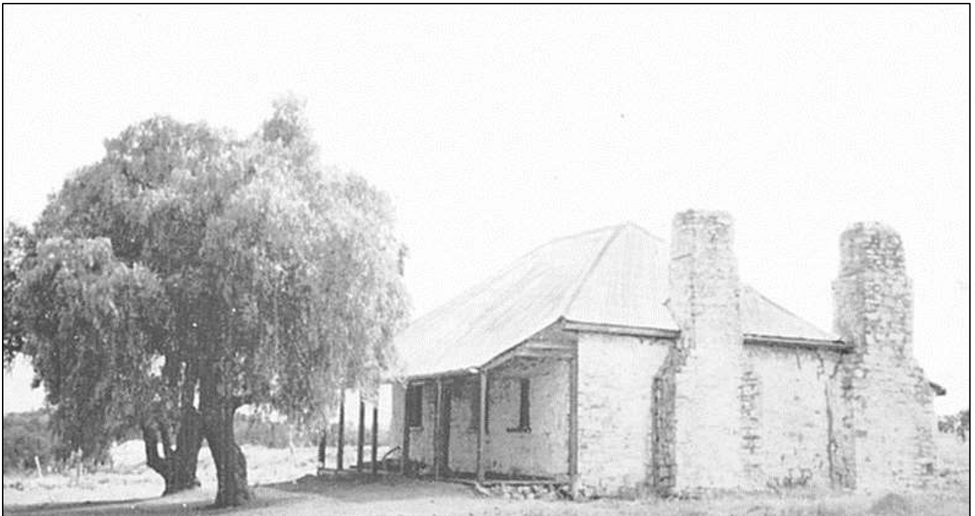
Old Barracks and Pepper Trees