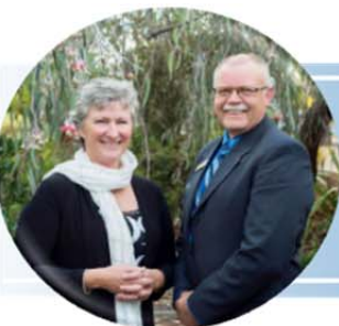
Shire President Ronnie Fleay

The changing weather conditions over the past 2 months has made treatment of roadside and reserves growth difficult necessitating slashing as we head towards the hotter months in order to reduce fuel loads. Please remain vigilant in reducing the fire risk on your property. Council will continue maintenance of street verges and collecting discarded rubbish and appreciates the efforts of residents and business owners who also assist in keeping verges and shop fronts neat and tidy especially given the increased traffic during the holiday period.