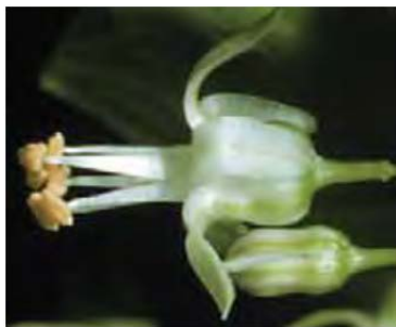
Bridal veil flower