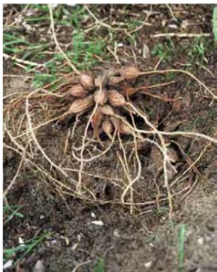
Tubers and fine root of bridal veil