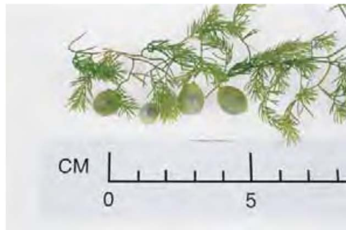
Green bridal veil berries