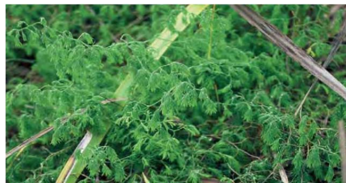
Bridal veil cladodes (leaves)