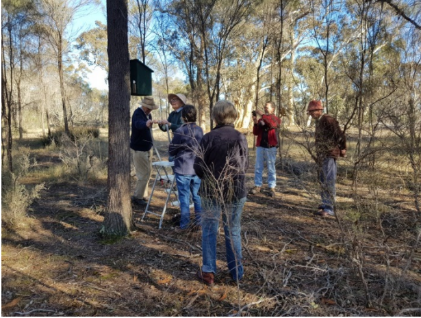
Checking a nesting box