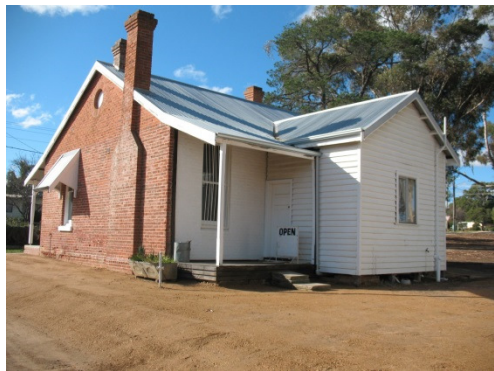
Remediation of the site has now occurred.