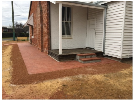
The Old Post Office now features enhanced drainage and improved disability access.