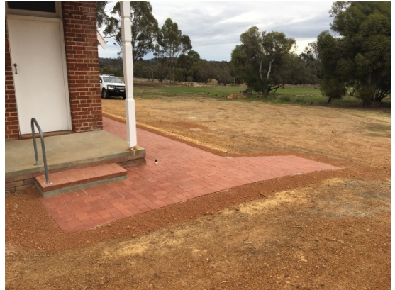
Reception Room Foyer Entrance