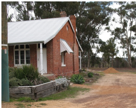
Before: stormwater undermining footings and brickwork.

The Old Post Office Paving, Stormwater, Drainage Improvements