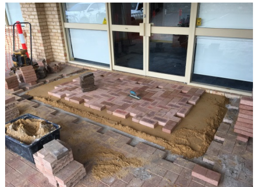
Improved disability access