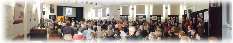
Panorama

There are many others who deserve recognition and thanks for their behind the scenes assistance and time, your help and contributions were invaluable.