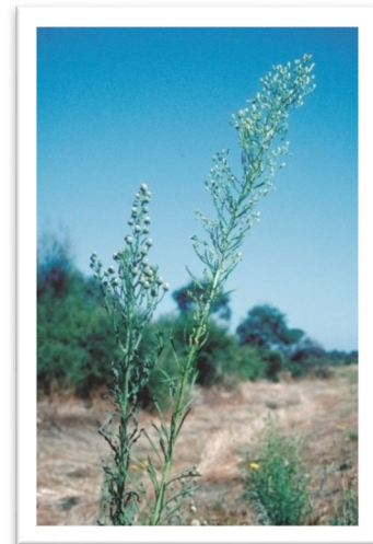
Caption: Fleabane, courtesy of Department of Primary Industries and Regional Development photo library.

Physical Description: Annual herbs with an erect, often greyish, leafy flowering stem. They have small, cream to white flower heads appearing in summer and autumn.