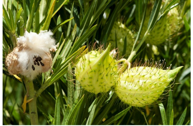
Caption: Cottonbush seed pods

Physical Description: An erect shrub to 2 m high producing a milky sap when damaged. The flowers are white to cream and the leaves are long, sparsely hairy and pointed.