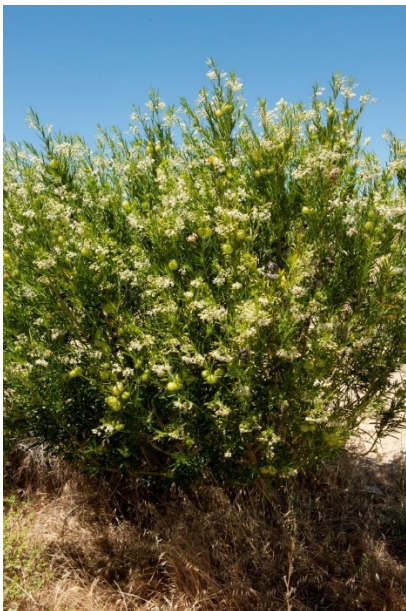
Caption: Cottonbush, courtesy of Department of Primary Industries and Regional Development photo library.