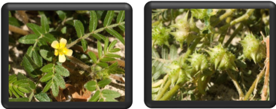
(Left to right) Caption: Caltrop flower courtesy of Department of Primary Industries and Regional Development photo library. Caption: Caltrop seed pods courtesy of Department of Primary Industries and Regional Development photo library.

Physical Description: Caltrop has long and wiry trailing stems. They are covered with fine hairs. The stems lie prostrate on the ground, radiating from a central taproot. The leaves consist of several leaflets arranged opposite each other on the stems. The leaves are fern-like and greyish-green. The flowers are small, less than 1cm in diameter, and yellow with five petals.