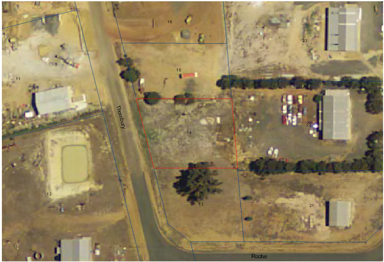
Lot 14 Thornbury Close

Section 3.58 of the Local Government Act 1995 states: