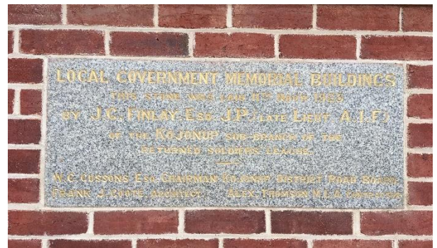
After . . .