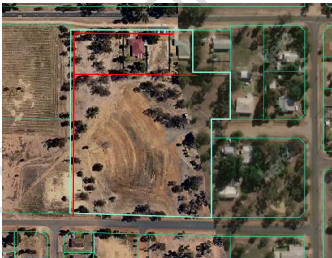
Sewer Line extension from Murby Street which captures 26 – 34 Katanning Road