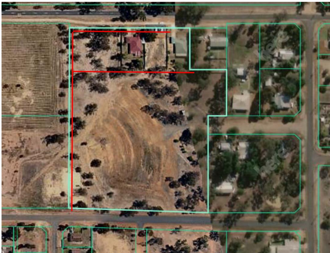
Sewer Line extension from Murby Street which captures 26 – 34 Katanning Road

Council encourages queries for allied health services to approach the new Medical Centre via Dr Du Preez. If negotiations do not prove fruitful and there is a facility available for hire whether half day, full day or weekly then Council should not discourage such approaches and will deal with each application on its merits.