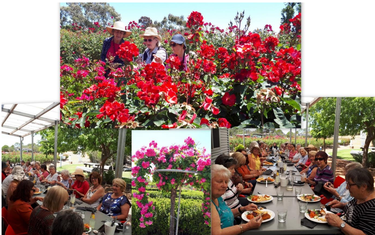
A Tour Group 'Lovers of Gardens' from Collie, visited the Rose Maze and enjoyed lunch at the Black Cockatoo Café.

They are also amazed to learn that it was designed, built and is maintained by Kojonup Volunteers, and the Kojonup Shire.