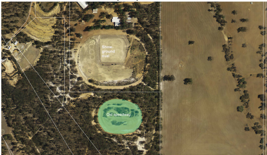
Old speedway site

Data Custodians: (c) Landgate (2017), Department of Parks and Wildlife, Department of Agriculture and Food Western Australia, Department of Water, Geoscience Australia. This project is supported by the South West Catchments Council through funding from the Australian Government and the Government of Western Australia. SWICC accepts no responsibility for damage, loss or injury caused by the use of information in this map document. SWICC does not warrant the accuracy or correctness of information supplied by third parties. Projection: Universal Transverse Mercator Zone 50 Datum: Geocentric Datum of Australia 1994 Date Printed: 2018-02-15T21:36:38