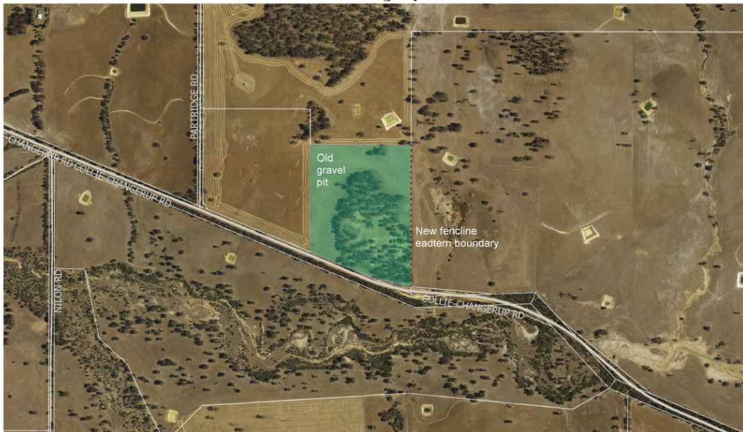
Gravel Pit - Collie-Changerup Road